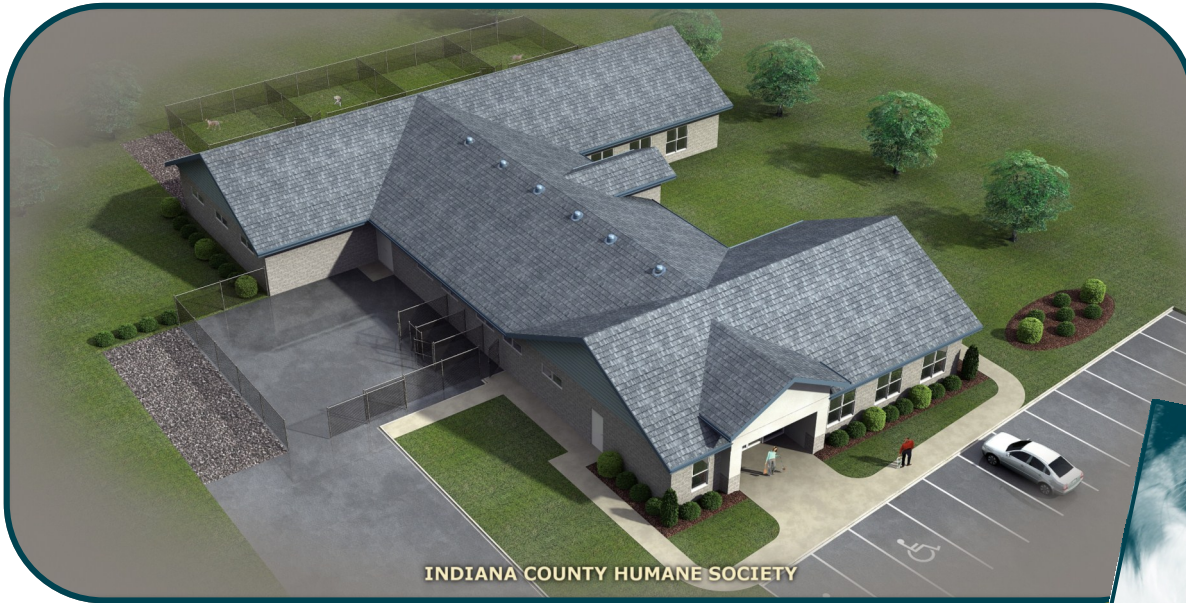
INDIANA COUNTY HUMANE SOCIETY