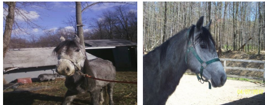
Before SHAKEER After